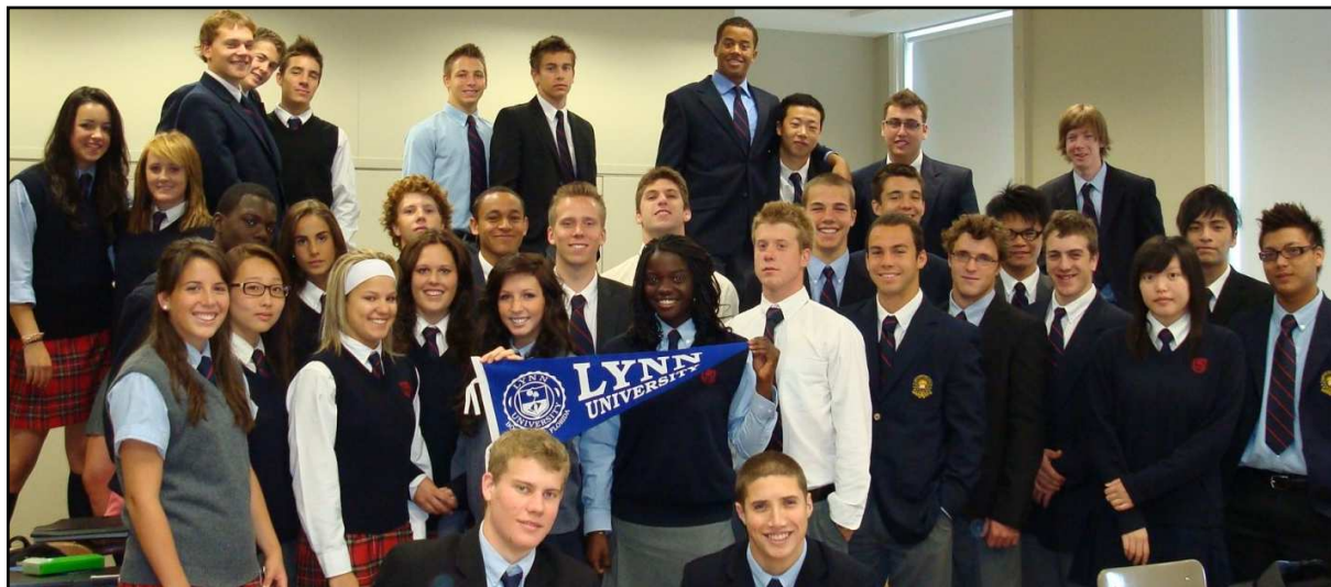
The Grade 12 class had a visit from representatives from Lynn University, one of several on-campus presentations this past fall.